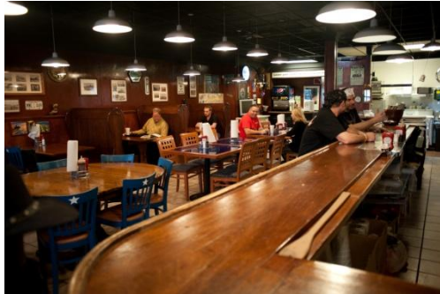
Our restaurant is located at 122 South Union St. in the Village of Spencerport

If you would like something different than listed just ask!