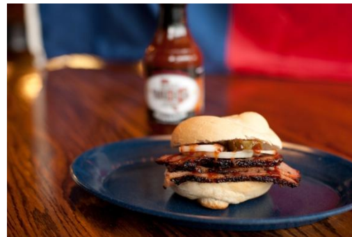
Our Slow Smoked Beef Brisket will make your mouth buds tingle.