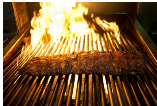
Our Baby Backs are tender & moist and smoked with Mesquite wood imported from Texas.

We do offer desserts and drinks. Please ask for details and varieties.